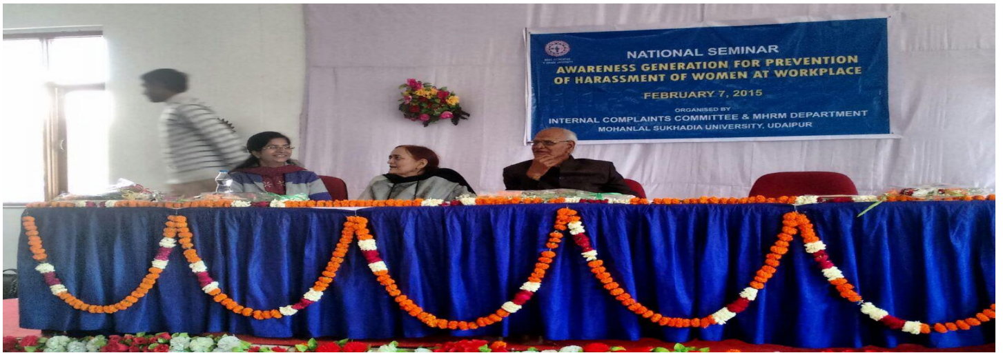
Co-chairing Technical Session at National Seminar, MLSU, Udaipur