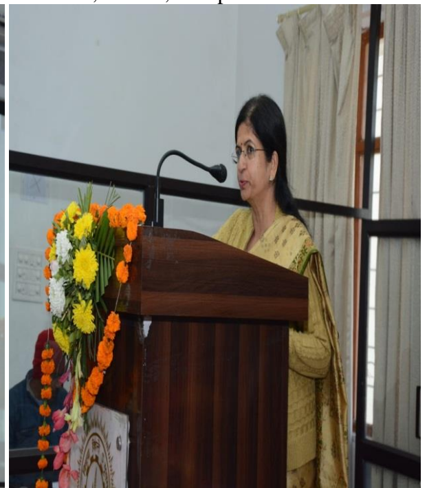
Key Note Speaker National Seminar at MLS University Udaipur