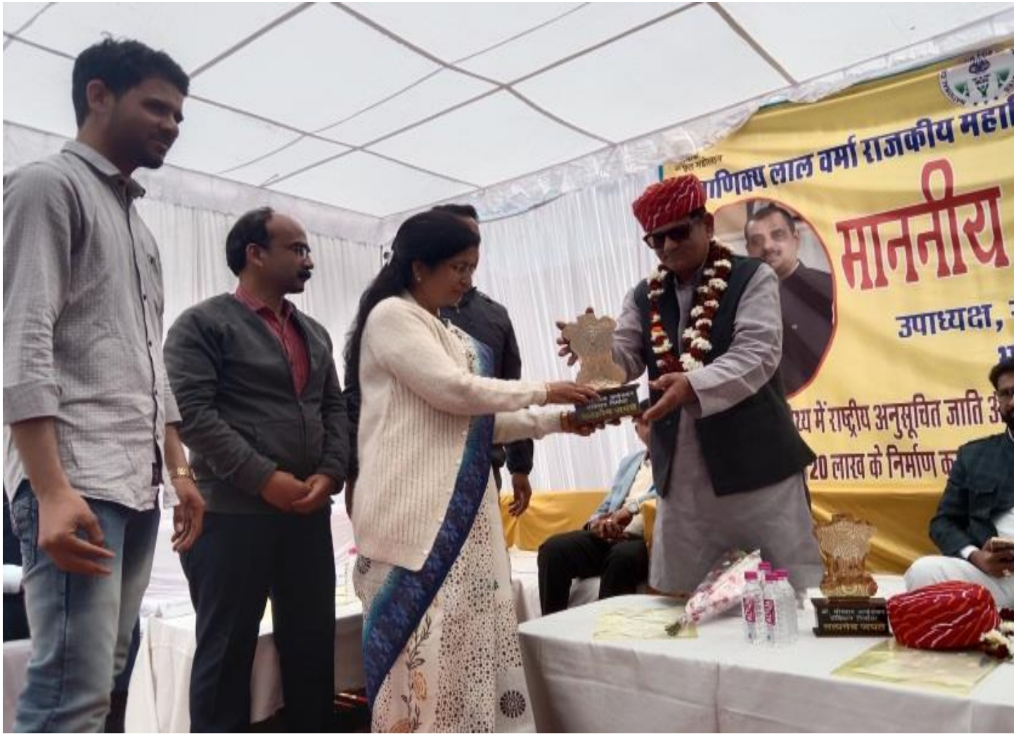
Students' Union Inugral