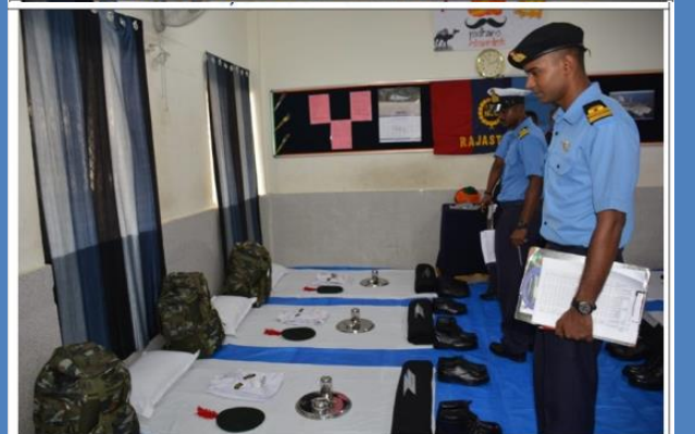
NAVAL WING, SPCGCA