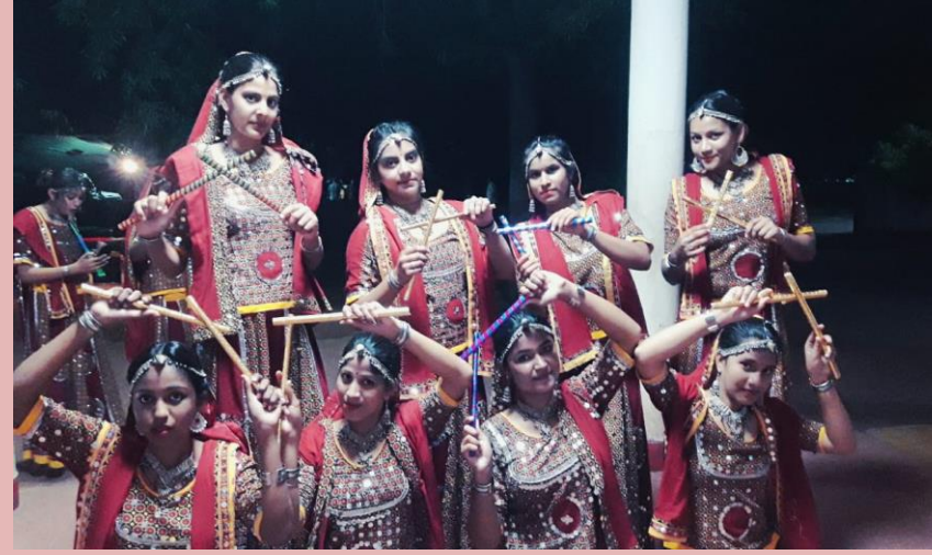
(5 RAJ ARMY GIRLS BATTALION)