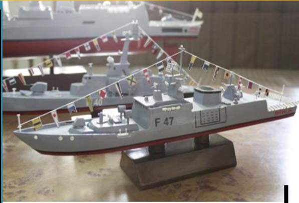
SHIP MODELLING BY CADETS