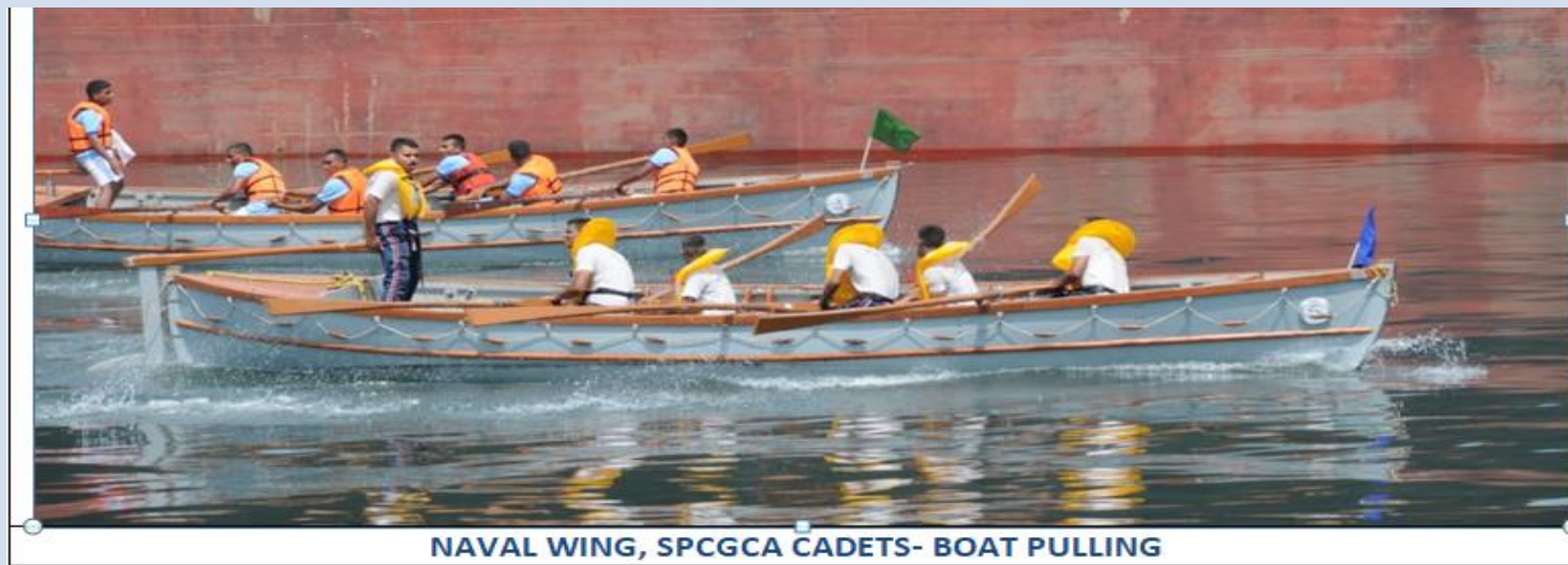
NAVAL WING, SPCGCA CADETS- BOAT PULLING

C certificate exam 27 cadets appeared in C exam