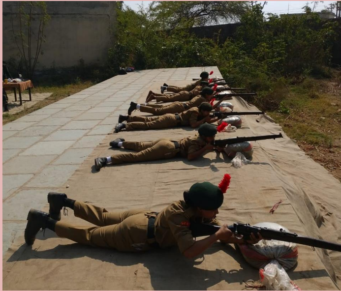
FIRING TRAINING (5 RAJ ARMY GIRLS BATTALION)