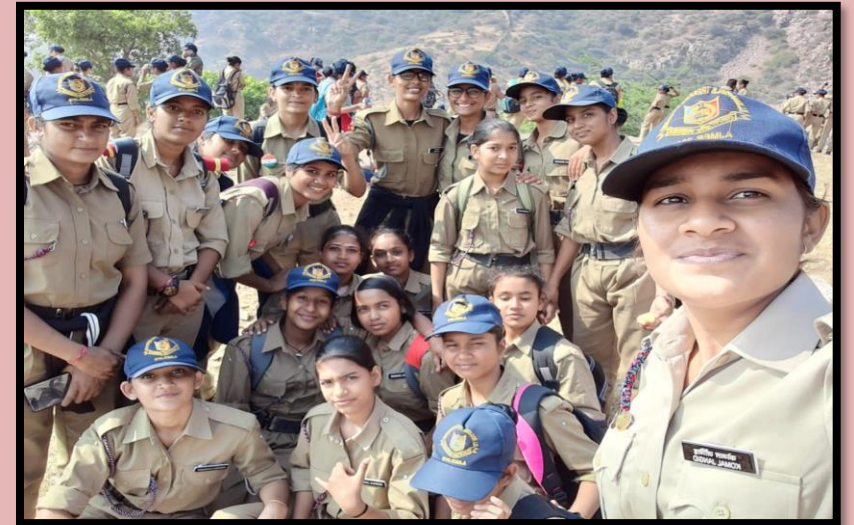
(5 RAJ ARMY GIRLS BATTALION)