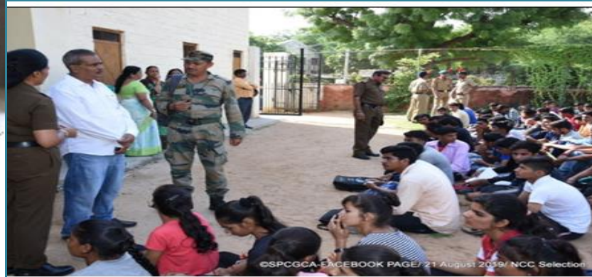
NCC ADMISSION PROCESS