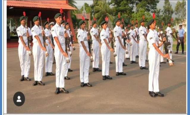
GOLD MEDAL, RAJASTHAN CONTINGENT – ALL INDIA NAU-SAINIK CAMP 2019