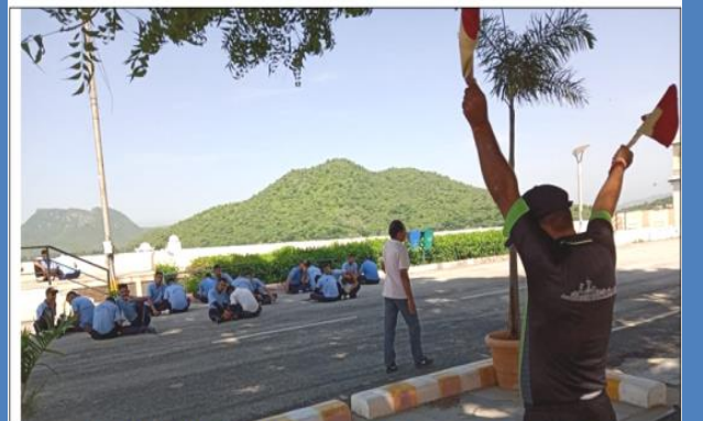
NAVAL WING, SPCGCA- SEMAPHORE TRAINING