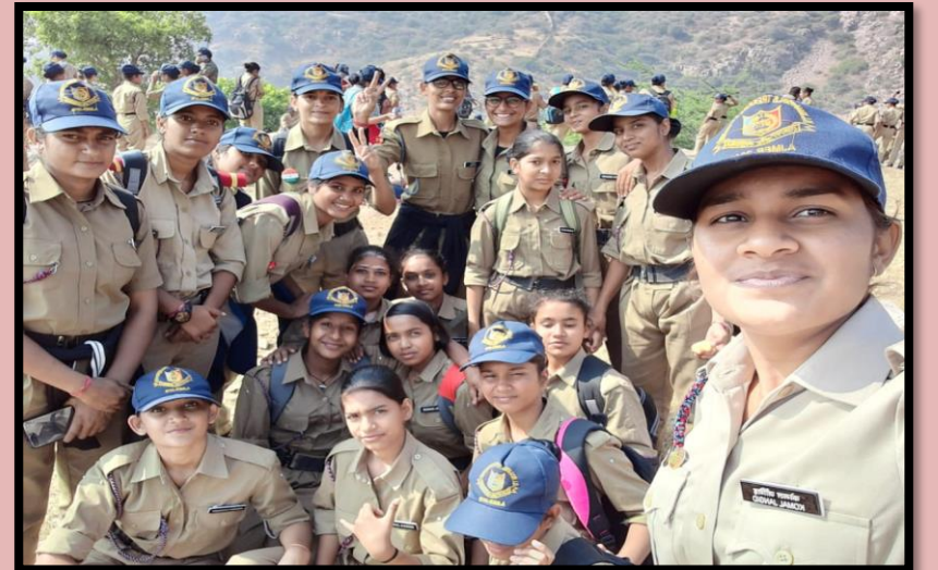
(5 RAJ ARMY GIRLS BATTALION)