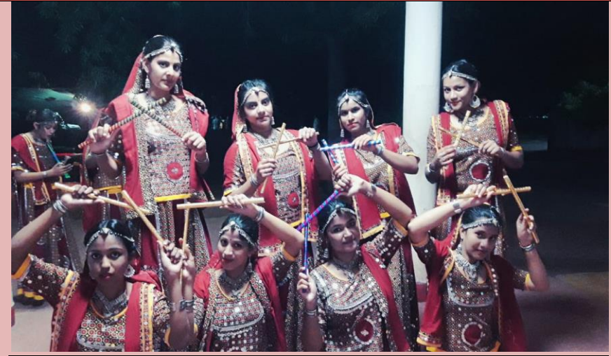
(5 RAJ ARMY GIRLS BATTALION)