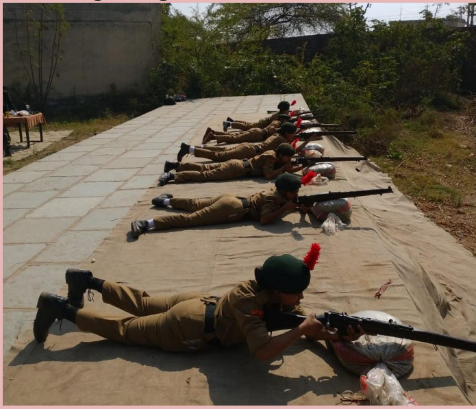
FIRING TRAINING (5 RAJ ARMY GIRLS BATTALION)