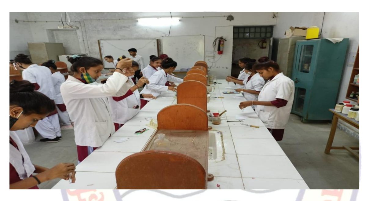
PRACTICAL CLASSES IN CHEMISTRY