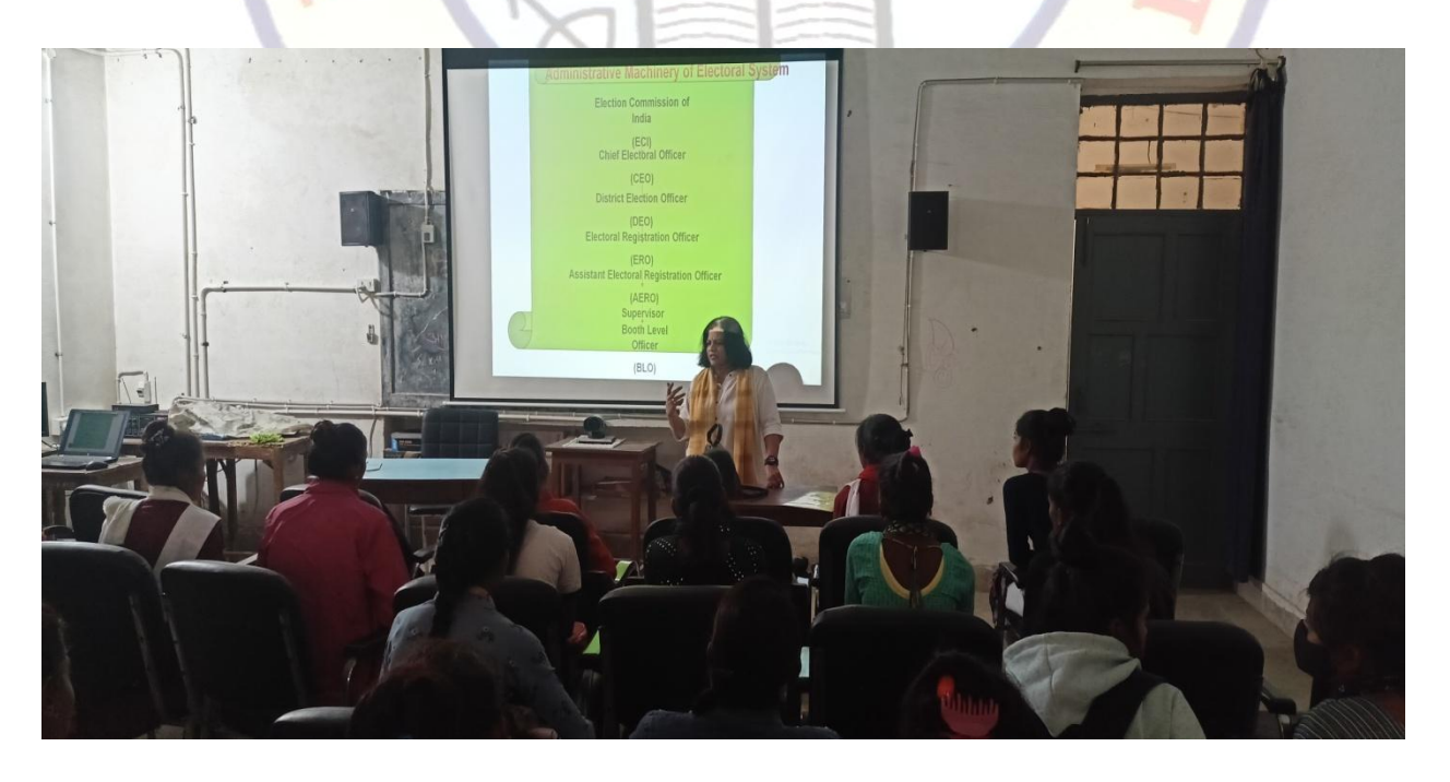
Use of ICT while Teaching