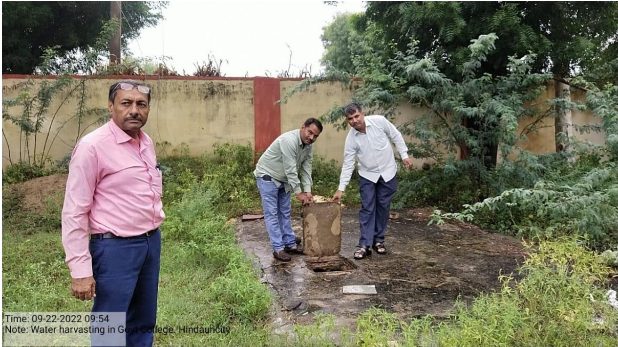
Time: 09-22-2022 09:54 Note: Water harvesting in Govt College, Hindaun City