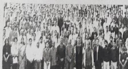
एमएचआरडी में एआईटी में हुए एआईटी में एक उच्च-स्तरीय कार्यक्रम के अंतर्गत एक विचारधारा के साथ प्रयास.