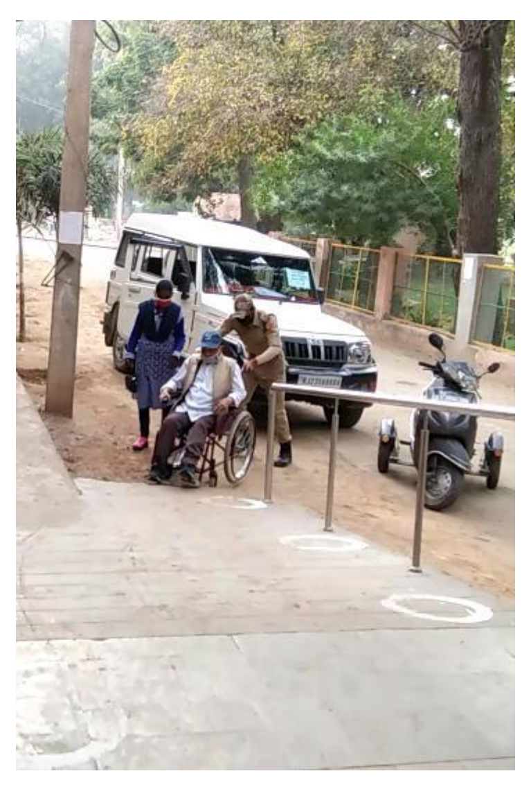
7.1.7 Built environment with ramps