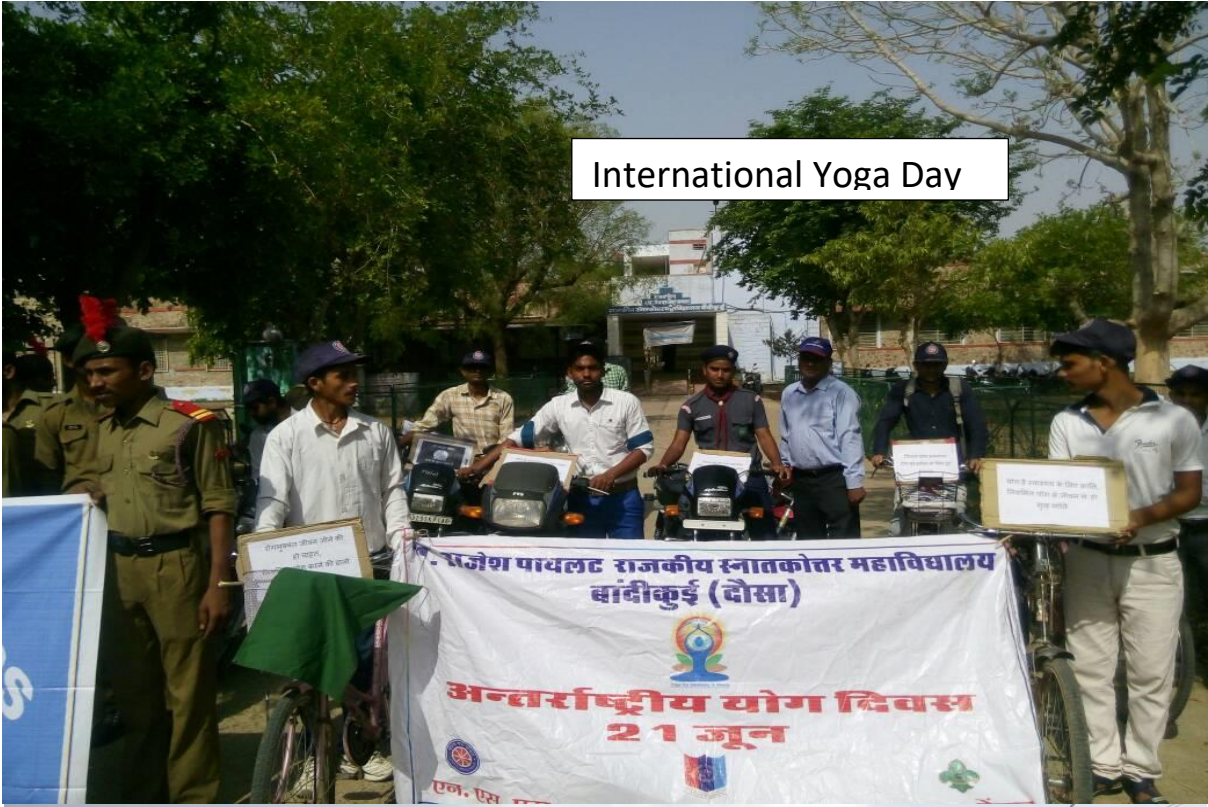
International Yoga Day