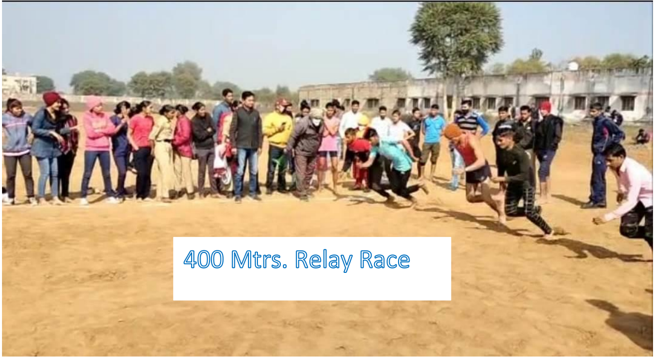
400 Mtrs. Relay Race