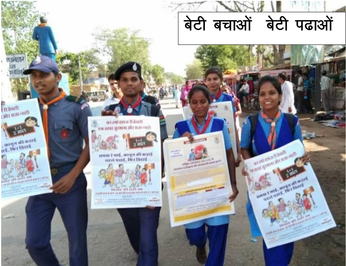
बेटी बचाओं बेटी पढाओं