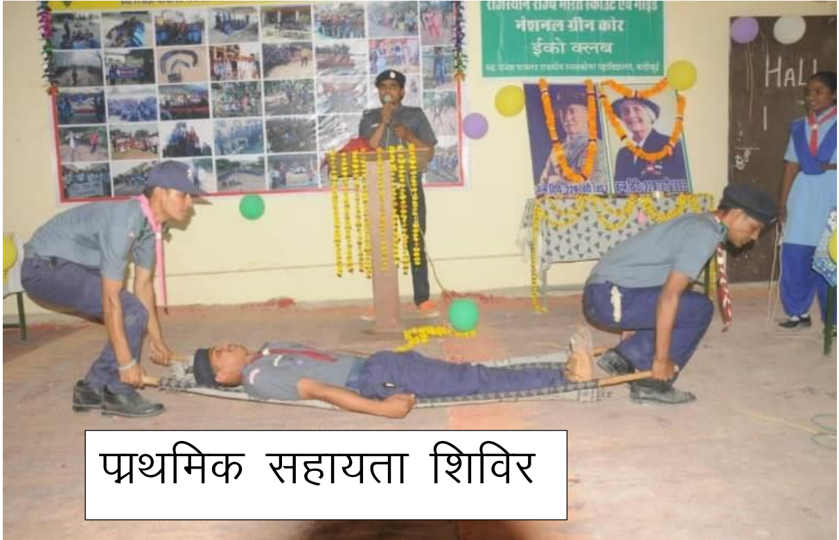
प्रथमिक सहायता शिविर