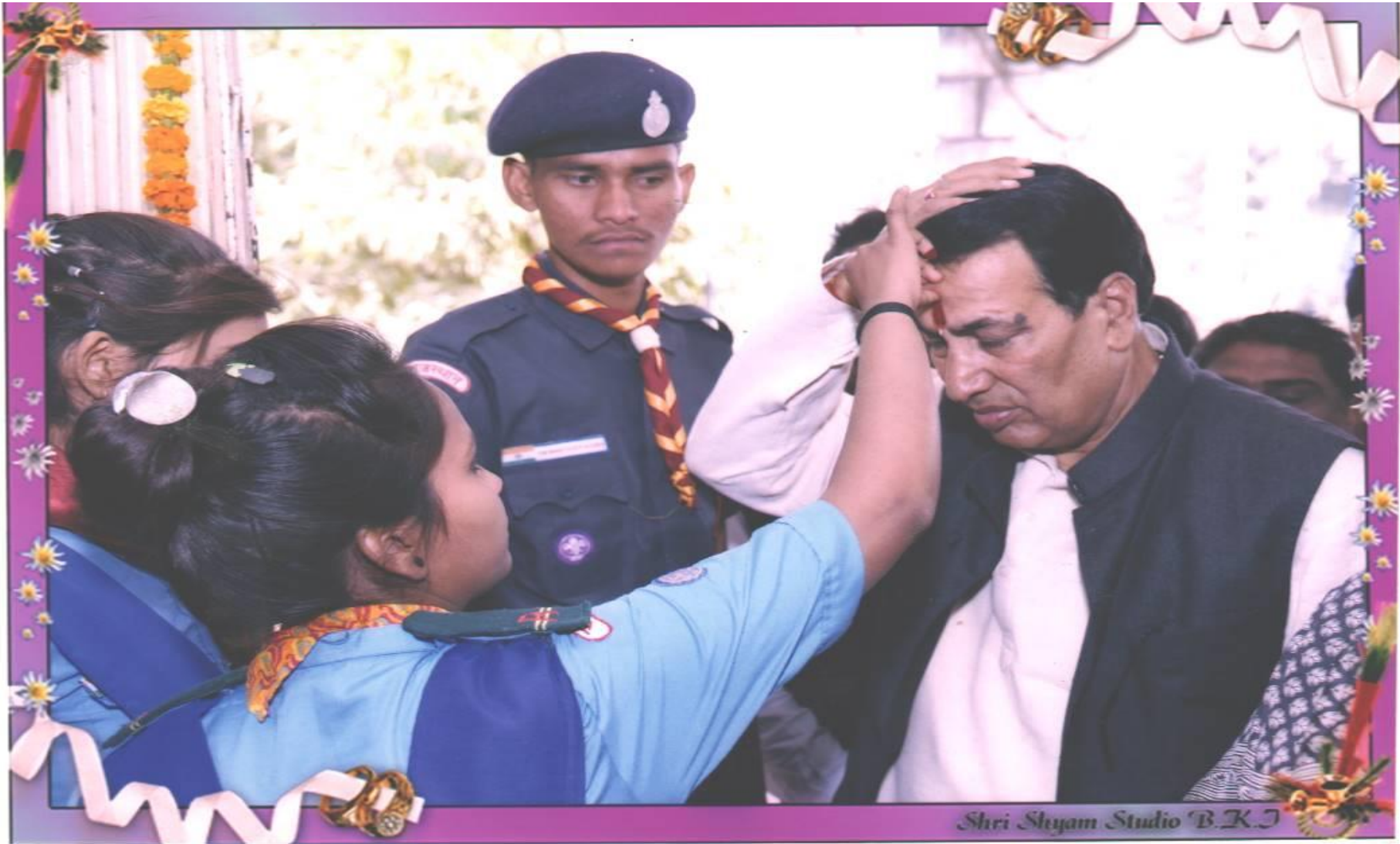
Shri Shyam Studio 'B.K.J'