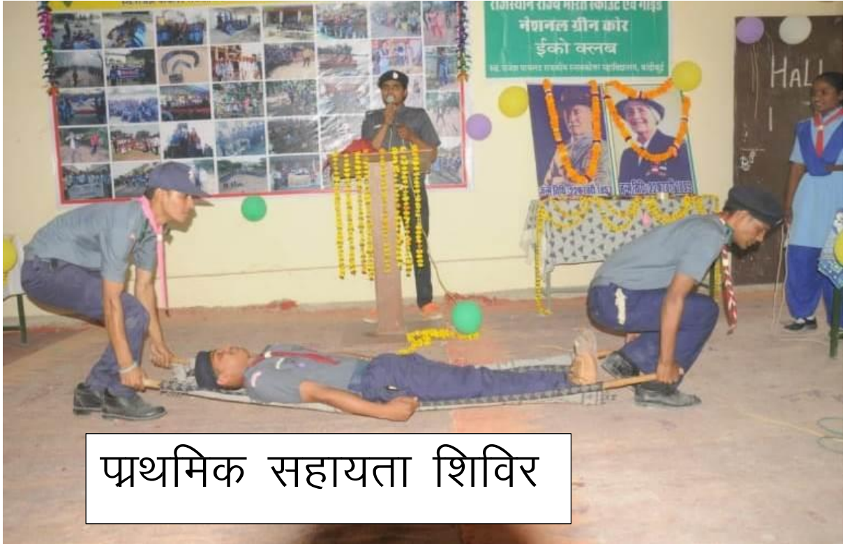
प्रथमिक सहायता शिविर