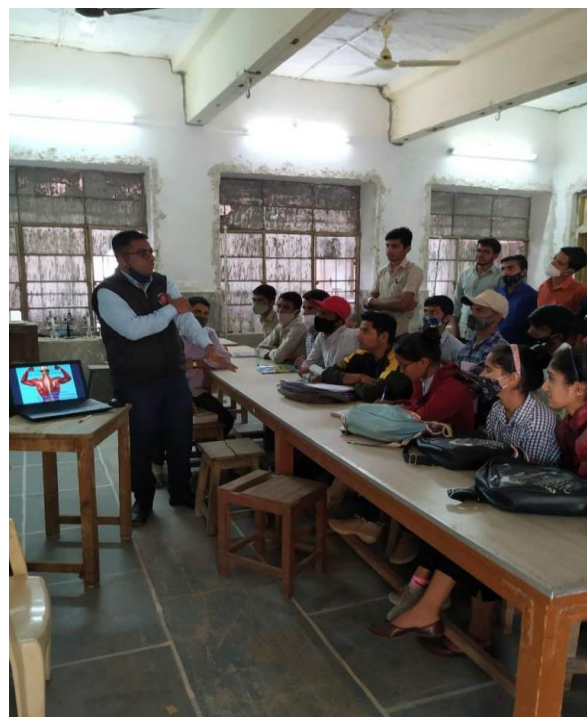
TEACHING USING LAPTOP