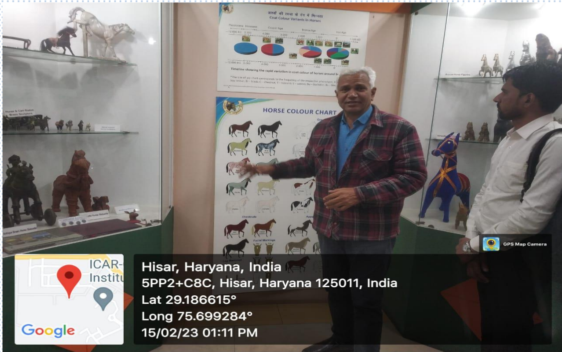
Image 4: Scientists provide special information about horses through statues and charts