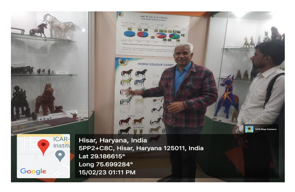
Image 4: Scientists provide special information about horses through statues and charts