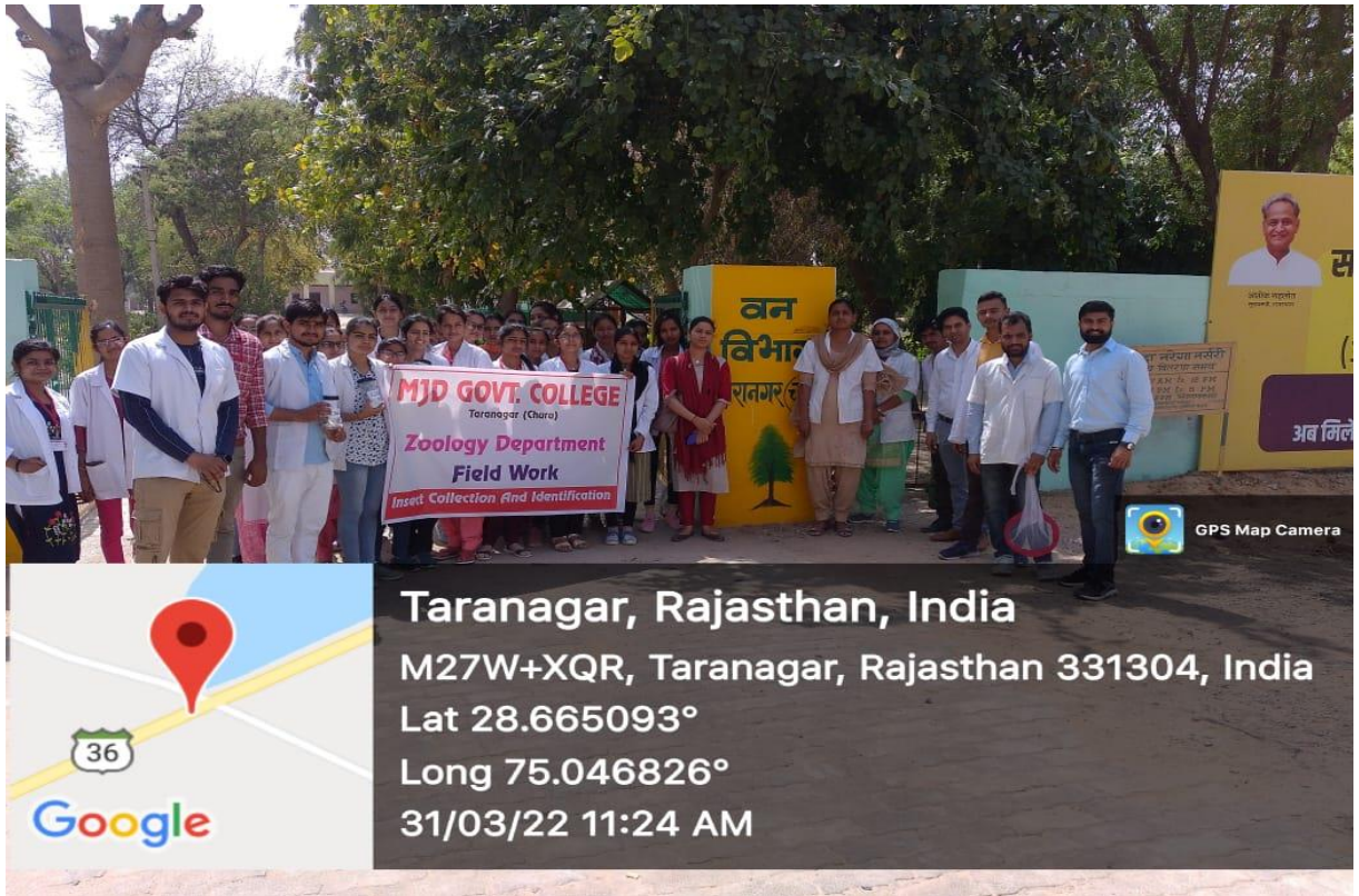
Image 2: Students with Faculty Members at the entrance of the Forest Department