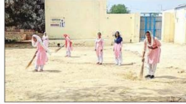
स्वयंसेवी विद्यार्थी श्री गुरुद्वारा साहिब में सफाई करते हुए।