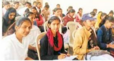
सादुलशहर, राजकीय महिला महाविद्यालय में आयोजित कार्यक्रम में उज्ज्वल छात्राएं।