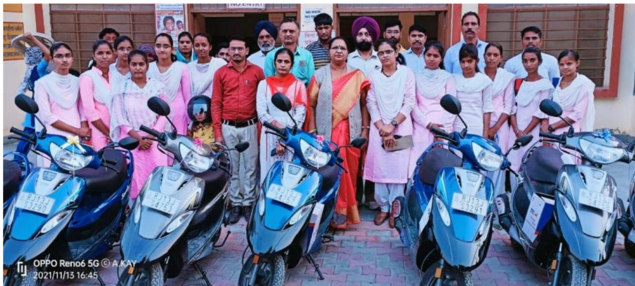
OPPO Reno6 5G © A.KAY 2021/11/13 16:45