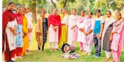
सादुलशहर, राजकीय महिला महाविद्यालय में साफ-सफाई करती स्वयंसेवी छात्राएं।