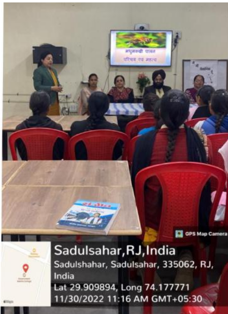
Sadulshahr, R J, India Sadulshahr, Sadulshahr, 335062, R J, India Lat 29.909894, Long 74.177771 11/30/2022 11:16 AM GMT+05:30