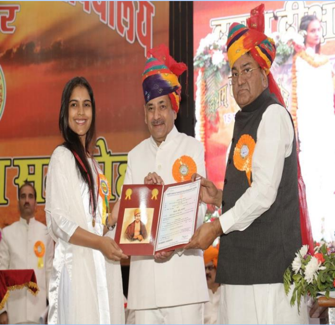
2018 GOLD MEDALIST NEELAM DHOOT