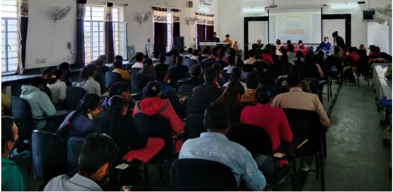
Incubation Inauguration in College: Students attending the Inauguration Programme