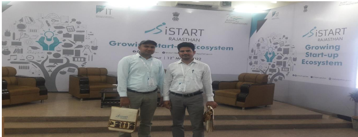
Mentor Professors attending the Incubation Training Programme on 14 March 2022 at Mohanlal Sukhadia University, Udaipur