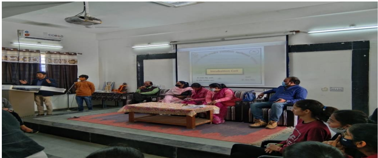
Incubation Cell Inauguration Programme in College