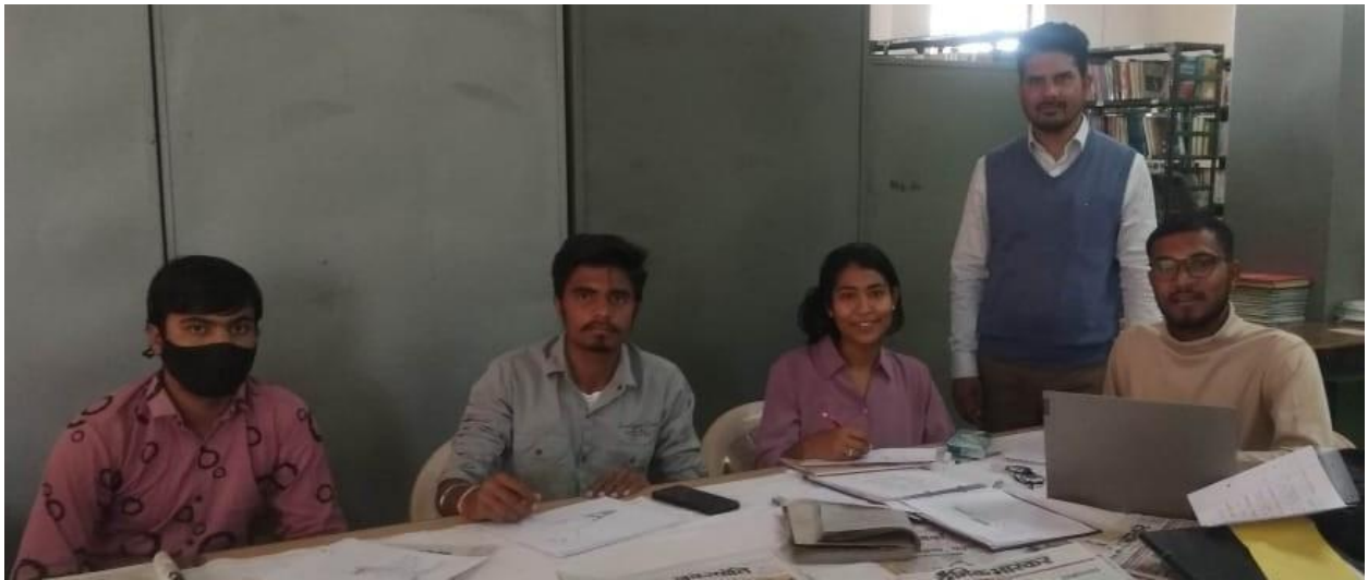
Mentor Professor and Interested Students for initiating Startups