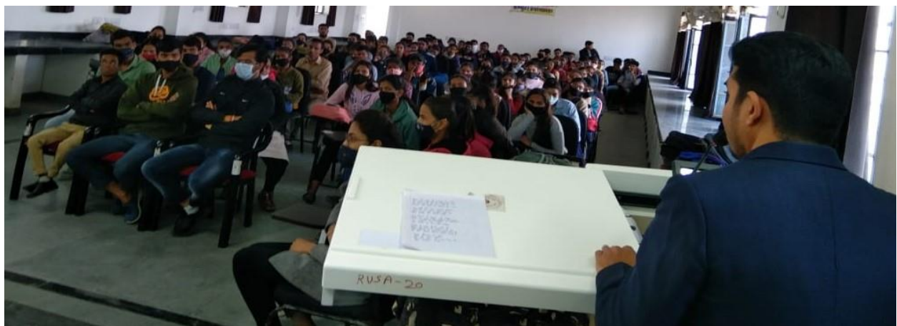
Incubation Inauguration Programme in College: Orienting the Students