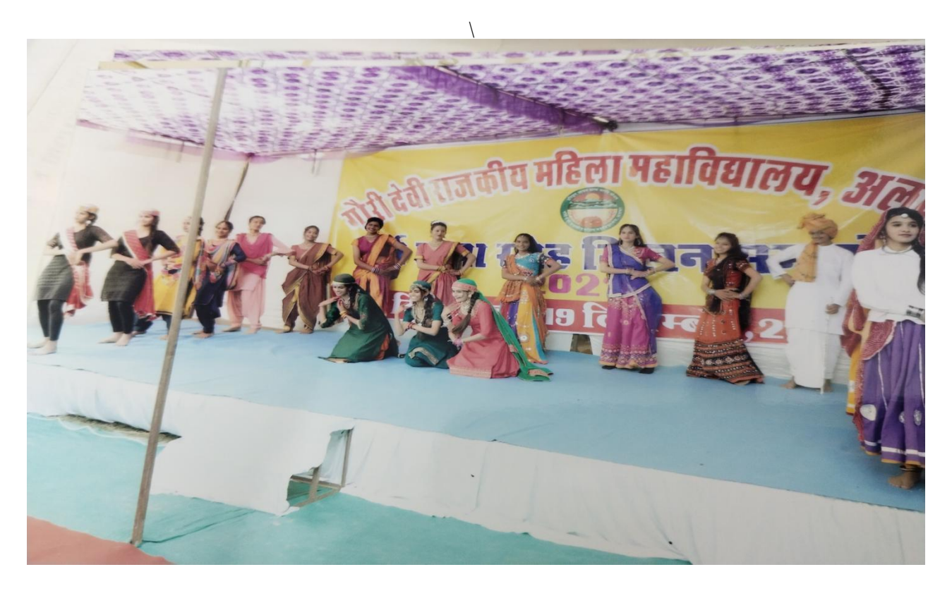
CULTURAL PROGRAM TO ENTERTAIN THE ALUMNI