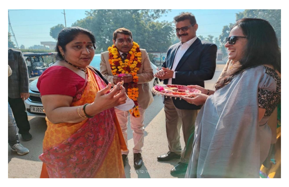
WELCOME OF FORMER PRINCIPAL WHO INITIATED TO REGISTER ALUMNI ASSOCIATION