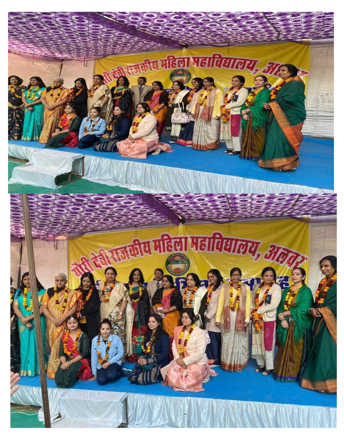
ALL ALUMNI PRESENT IN THE FIRST REGISTERED ALUMNI MEET