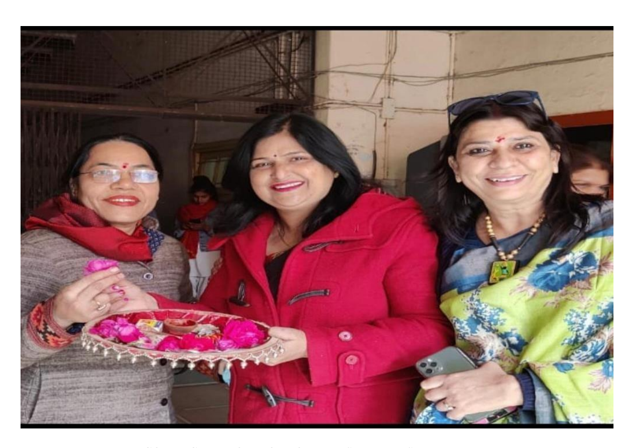
WELCOME CEREMONY OF FORMER STUDENTS