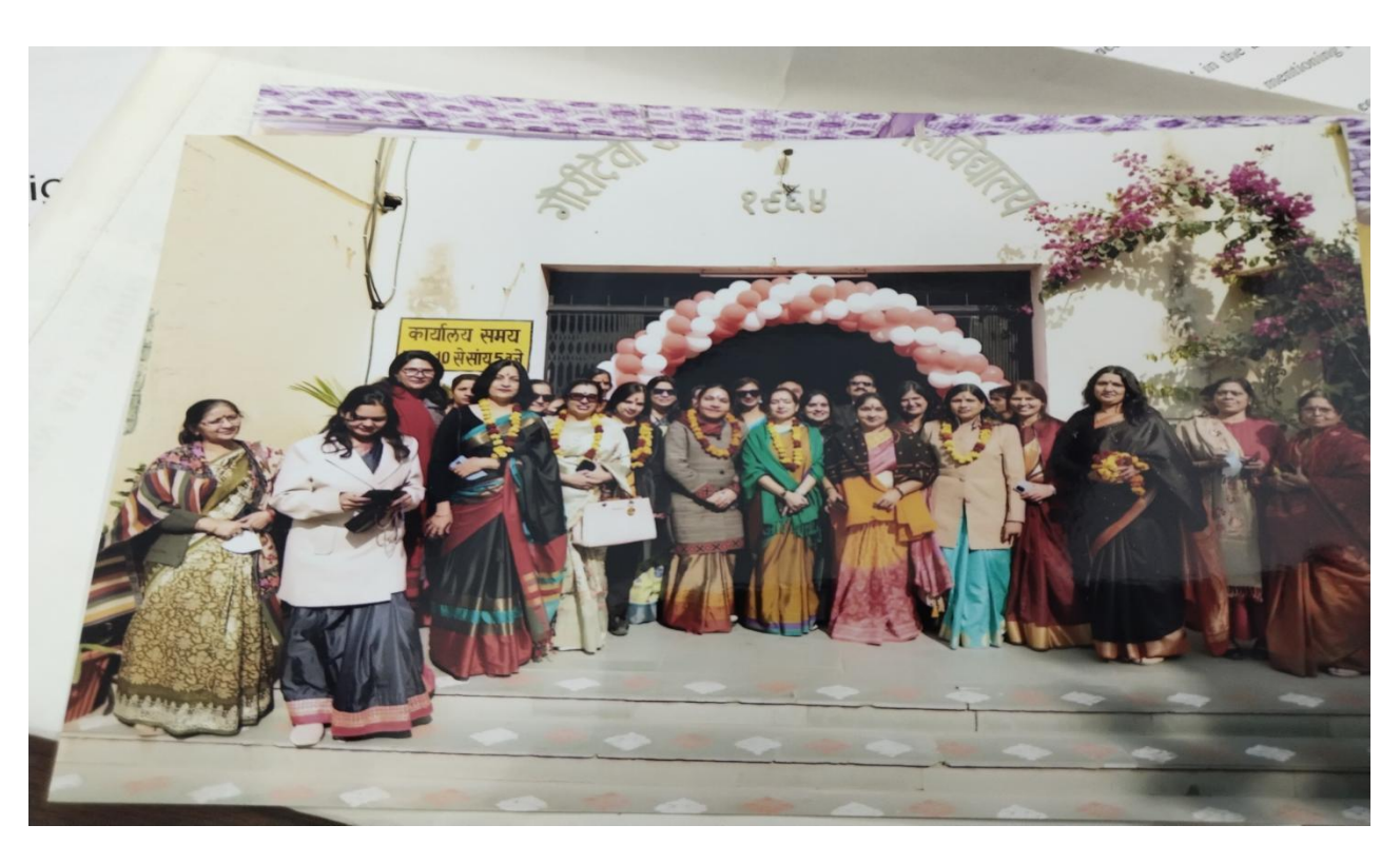
FINAL CLICK OF THE DAY