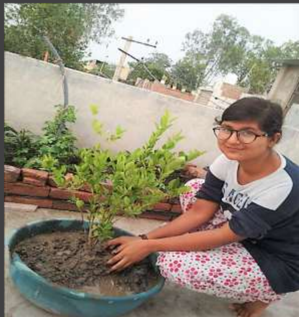
Students planting medicinal plants at their homes

Conserving our environment is the key to the survival of the ecosystem and mankind. It is a practice to preserve our nature from collapsing as a consequence of human activities. The Environmental Conservation Committee of our college is devoted to making its contribution for protecting the environment. On the occasion of 'World Environment Day', the committee adhered to the theme of "One Student One Tree". Committee members, students and faculty members planted trees on the campus and motivated the students to plant one tree in their surrounding area. In October 2021, a workshop on cleanliness was organized and approximately 100kg single used plastic was collected. The students even voluntarily cleaned some areas of the campus. This initiative gave acceleration to the cleanliness drive. In February 2022, Rain Water Harvesting Programme was organized based on the theme "Catch the Rain". The precious and indispensable nature of water was emphasized by our Principal and eminent speakers.