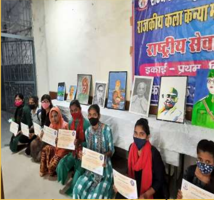
राष्ट्रीय महानायकों पर चित्र प्रदर्शनी

वर्ष पर्यंत कार्यक्रमों की निरंतरता में एन.एस.एस. की तीनों इकायों द्वारा 2 अक्टूबर को गाँधी जी की जयंती पर स्वैच्छिक रक्तदान शिविर का आयोजन किया गया। अक्टूबर माह में ही “गाँधी, नेहरु और अंबेडकर की दृष्टि” पर ऑनलाइन भाषण प्रतियोगिता एवं “मौलाना अब्दुल कलाम आज़ाद के शिक्षा दर्शन” एवं “स्वाधीनता आन्दोलन की विरासत” पर व्याख्यान का आयोजन किया गया। इसी माह भारत के महानायकों पर आधारित चित्र प्रदर्शनी, सरदार पटेल जयंती पर राष्ट्रीय एकता दिवस और स्वच्छता कार्यशाला का आयोजन भी हुआ जिसमें तीनों इकायों की स्वयंसेविकाओं द्वारा 100 किलो सिंगल यूज प्लास्टिक का एकत्रण किया गया। इसी तरह कौमी एकता सप्ताह, संविधान दिवस, विश्व एड्स दिवस, अभिमुखीकरण शिविर, मानवाधिकार दिवस, राष्ट्रीय उपभोक्ता दिवस, राष्ट्रीय युवा दिवस, बोस जयंती, शहीद दिवस के आयोजनों के साथ-साथ विभिन्न महत्त्वपूर्ण ऑनलाइन व्याख्यान आयोजित किए गए।