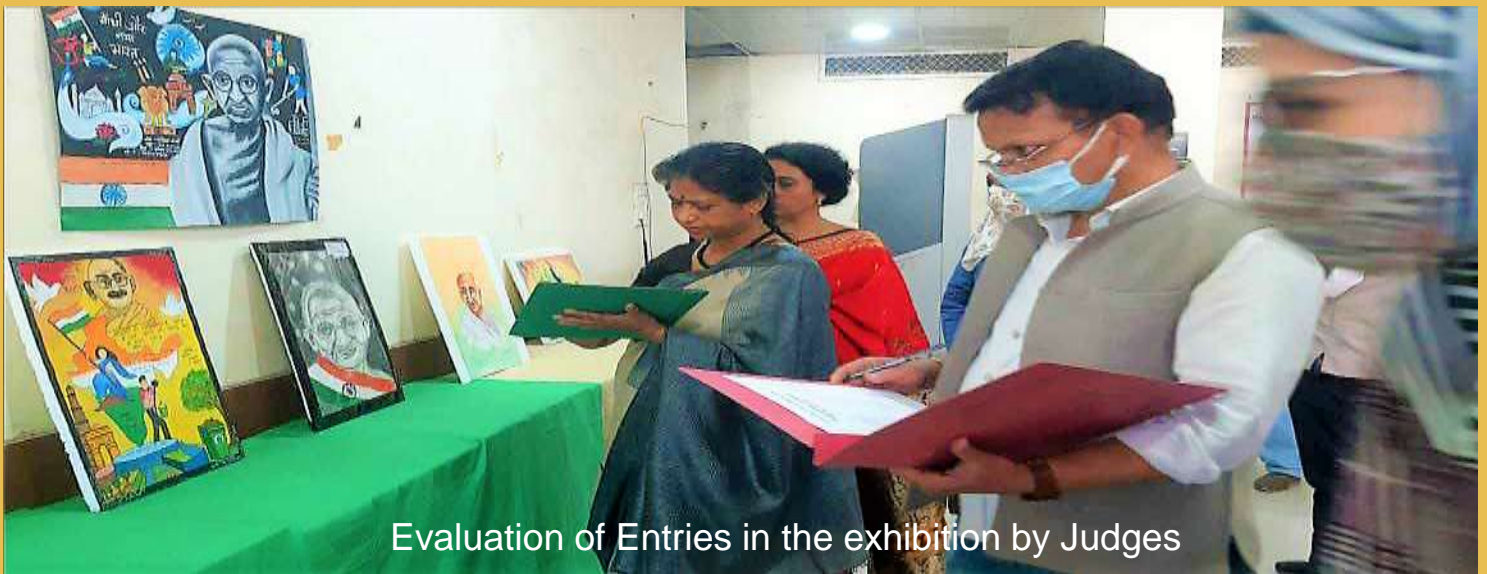
Evaluation of Entries in the exhibition by Judges

The students of the Department of Home Science exhibited their 'Tie and Die Creations' prepared in a workshop organized by the department. NSS units also held an exhibition on the leaders of freedom struggle to acquaint and inspire our new generation .