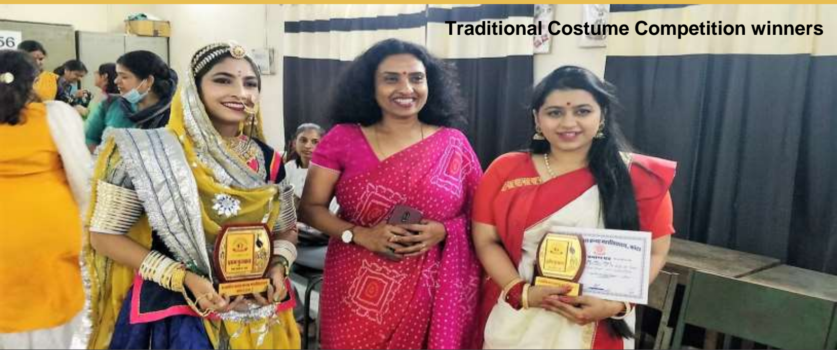
Traditional Costume Competition winners