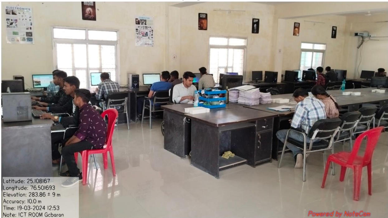
Students studying in the ICT Lab.

2.3.1: Student centric methods, such as experiential learning, participative learning and problem solving methodologies are used for enhancing learning experiences and teachers use ICT- enabled tools including online resources for effective teaching and learning process