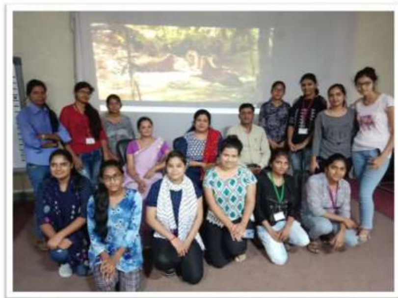
Film on 'Two Brothers' a story of two tigers was shown to students on 2 nd October 2019