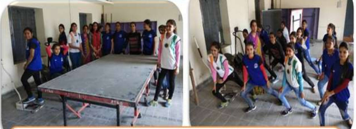
शारीरिक व्यायाम एवं अभ्यास हेतु जिम