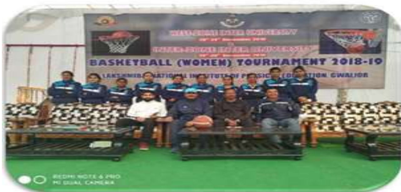
अन्तरविश्वविद्यालय वेस्ट जोन बास्केट बॉल प्रतियोगिता- ग्वालियर